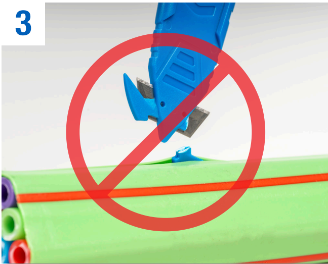
3. Do not lift up the MDS-100 while in microduct! NOTE: Keep tool handle down to reduce stress on slitting guides.