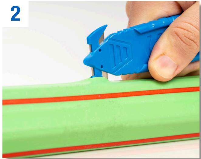
2. Stop slitting when needed.