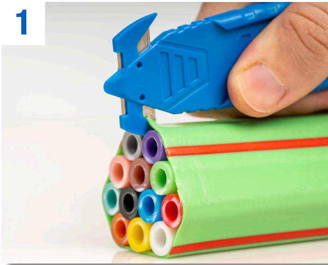
1. Start slitting at the end of your microduct.